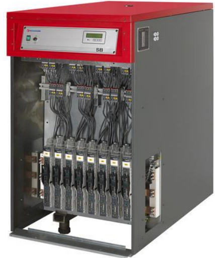
Picture showing SB 600kW/400V

For optimized economical operation, an outdoor temperature sensor may be connected (optionally) for weather compensated heat curve regulation. Integrated step limitation allow power limitation if needed.